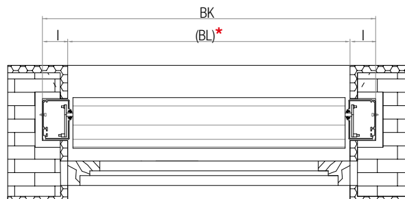
Sezione orizzontale guide incassate Horizontal section for embedded rail guides

* comunicare (BL)* MINIMA e la quota "I" (vedi soluzione pag. 35) advise MIN. (BL)* and "I" value see option on page 35